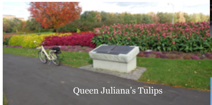
Queen Juliana's Tulips