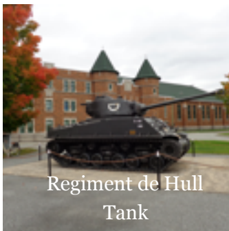
Regiment de Hull Tank