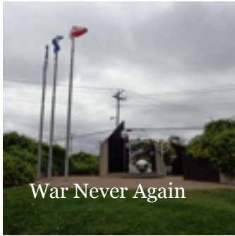
War Never Again