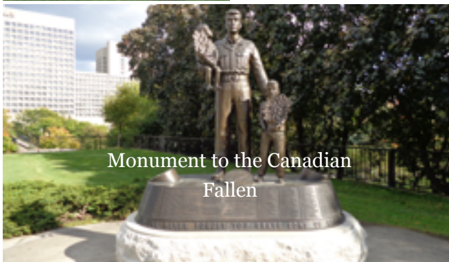
Monument to the Canadian Fallen