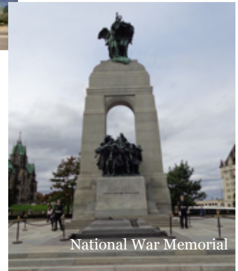
National War Memorial