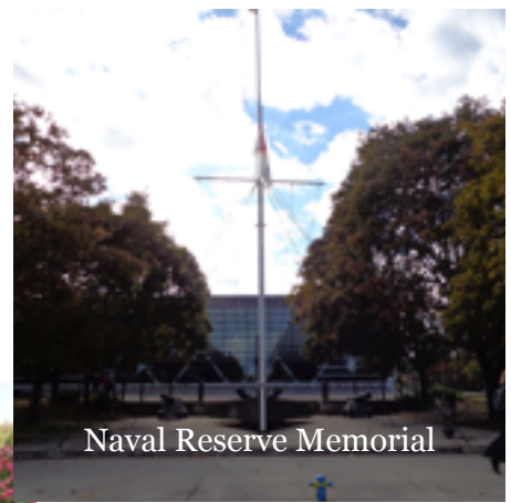
Naval Reserve Memorial