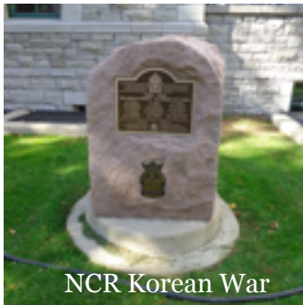
NCR Korean War