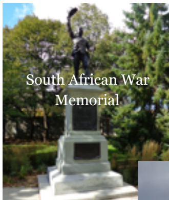
South African War Memorial