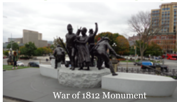
War of 1812 Monument