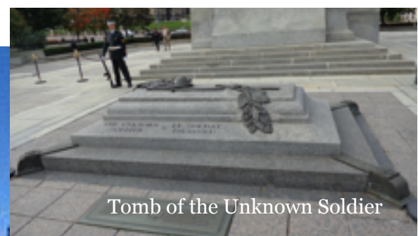
Tomb of the Unknown Soldier