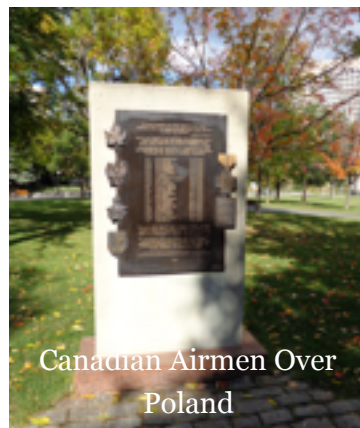
Canadian Airmen Over Poland