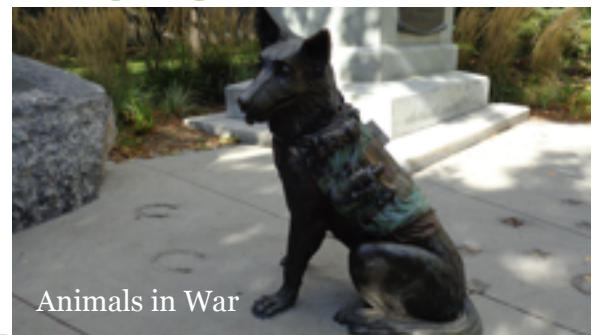
Animals in War