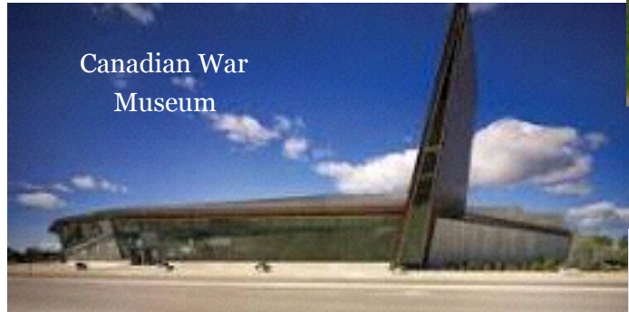
Canadian War Museum