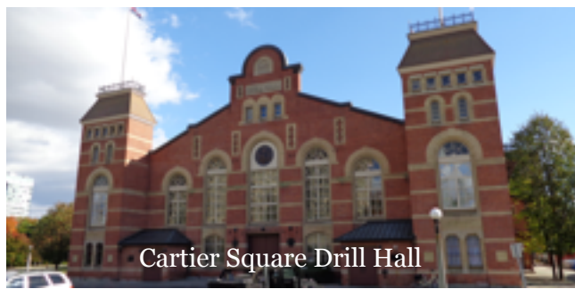
Cartier Square Drill Hall