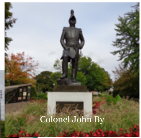
Colonel John By