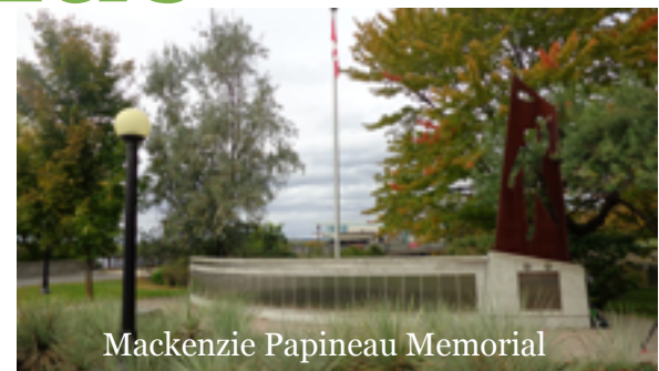
Mackenzie Papineau Memorial