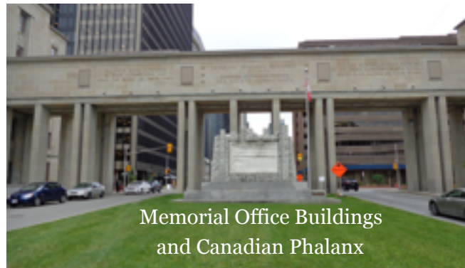
Memorial Office Buildings and Canadian Phalanx